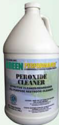
GPL 107 PEROXIDE CLEANER

NEUTRAL FLOOR CLEANER is designed to clean waxed floors without dulling the finish. A dual surfactant system provides for faster removal of soil from floor surfaces. Dries without streaking and no rinsing necessary. Use on all types of floors not harmed by water. Color – Yellow Fragrance – Fresh & Clean