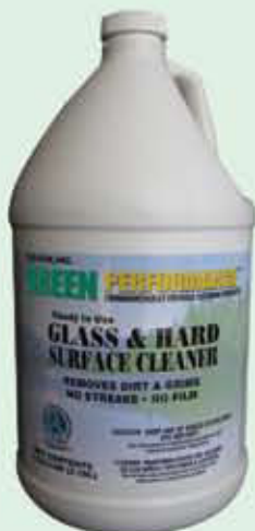
GPL 102 GLASS & HARD SURFACE CLEANER

HEAVY DUTY DEGREASER is a strong, concentrated formula that eliminates grease, oil and kitchen fats quickly and efficiently. Built with a four surfactant system, this product is designed to handle the toughest cleaning jobs. Use in a mop on application, in auto scrubbers, pressure washers and steam cleaners. Color – Purple Fragrance – Citrus/Floral