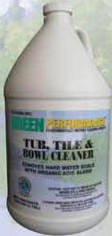
GPL 104 TUB, TILE & BOWL CLEANER

TUB, TILE & BOWL CLEANER uses a dual organic acid blend to remove scale and rust from showers, sinks, tubs, toilet bowls and fixtures. This product contains an environmentally friendly solvent for cleaning hard to remove body oils. Color – Blue Fragrance – Lime