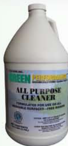
GPL 103 ALL PURPOSE CLEANER

GLASS & HARD SURFACE CLEANER is an advanced ready to use formula that cuts through dirt, grime, finger print marks and pollution film without premature drying or streaking. Also works effectively as a light duty hard surface cleaner. Built with two environmentally friendly solvents for stronger cleaning action. Color – Clear Fragrance – Lime