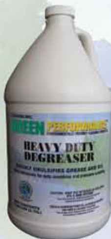
GPL 101 HEAVY DUTY DEGREASER

HEAVY DUTY DEGREASER is a strong, concentrated formula that eliminates grease, oil and kitchen fats quickly and efficiently. Built with a four surfactant system, this product is designed to handle the toughest cleaning jobs. Use in a mop on application, in auto scrubbers, pressure washers and steam cleaners. Color – Purple Fragrance – Citrus/Floral