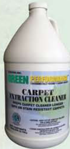
GPL 105 CARPET EXTRACTION CLEANER

TUB, TILE & BOWL CLEANER uses a dual organic acid blend to remove scale and rust from showers, sinks, tubs, toilet bowls and fixtures. This product contains an environmentally friendly solvent for cleaning hard to remove body oils. Color – Blue Fragrance – Lime