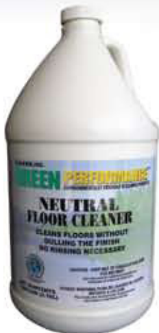
GPL 106 NEUTRAL FLOOR CLEANER

CARPET EXTRACTION CLEANER is a powerful formula compatible with today's generation of carpet fiber technology. Uses a dual system of environmentally friendly solvents for deeper cleaning. Recommended for all types of extraction equipment and may also be used for bonnet cleaning. Color – Clear Fragrance – Citrus/Floral